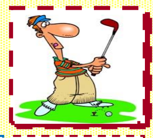
Dad -------(play) golf this weekend. X