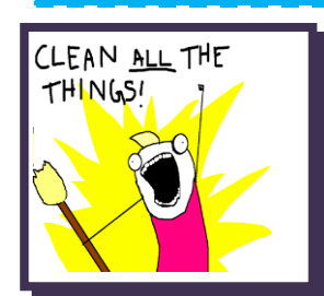
You ..... keep your desk clean.