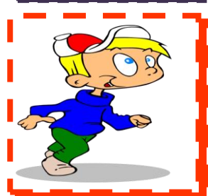
You .....run at school.