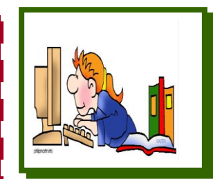
You....sit too close to the computer,