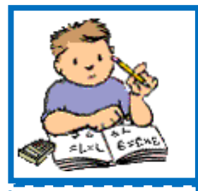
You.....do your homework.