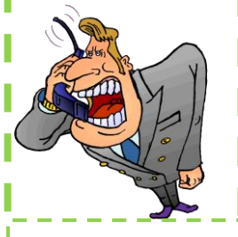
Your teacher..... speak on the phone