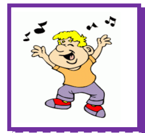
You....sing at the lesson.